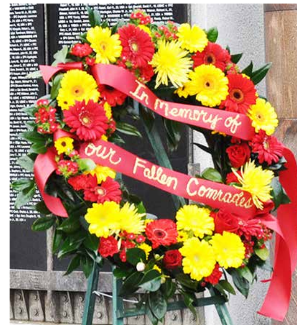
VVA 500 2013 CSC Legislative Day