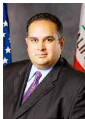
John A. Pérez Speaker of the Assembly

A portion of the morning program was also devoted to hearing from key legislators who were scheduled to drop in to address the group. 14 Assembly and Senate members stopped by to introduce themselves to the Council and to speak about veterans related legislation they are carrying: