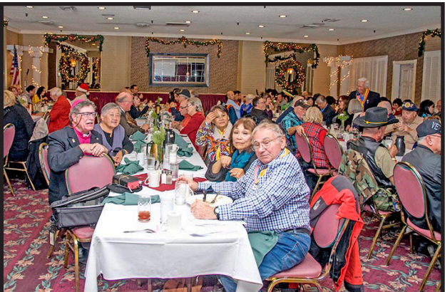
Chapter 201 Annual Holiday Banquet

Over 115 Chapter 201 members and guests attended the annual Holiday Banquet at the Three Flames Restaurant in San Jose on December 16, 2019.