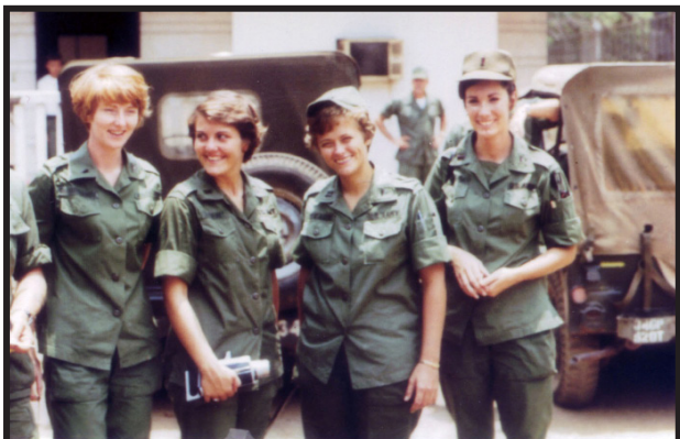
Army evacuation hospital, Vietnam, 1968.