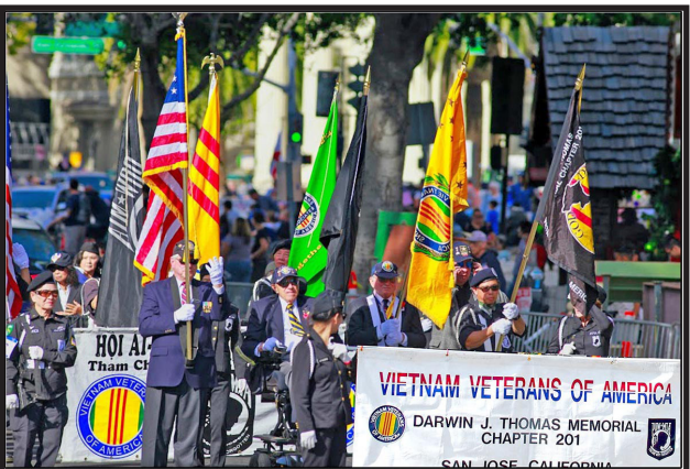
Chapter 201 participated in the UVC 2019 Veterans Day Parade