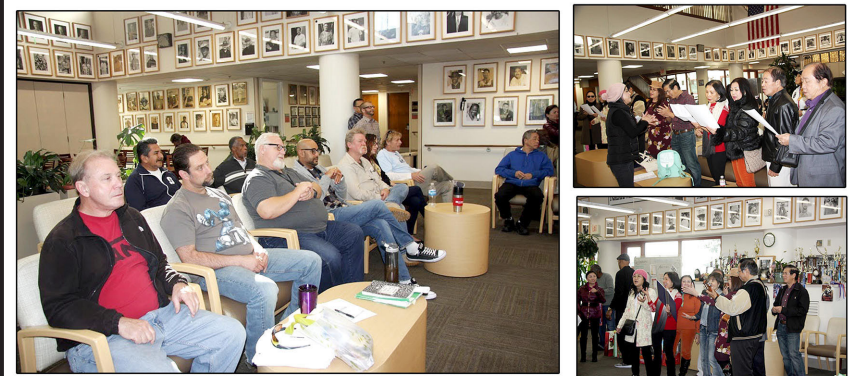
AVVA Chapter 201 Entertain VA Patients

AVVA members also provided string music and songs to entertain the patients to show gratitude for their service.