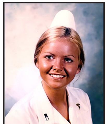
Graduation from Walter Reed Army Institute of Nursing 1977