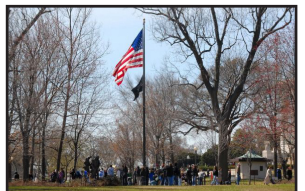
The flagpole and Three Servicemen statue were dedicated on Veterans Day 1984, when the entire Vietnam Veterans Memorial site was turned over to the U.S. government by VVMF as a gift to the American people.

1. The statue and flagpole were dedicated on Veterans Day 1984