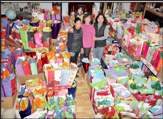
AVVA Chapter 201 Gift Packages

Over 200 holiday gift bags were distributed to the patients at the Palo Alto Hospital and over 300 were distributed at the Menlo Park Hospital.