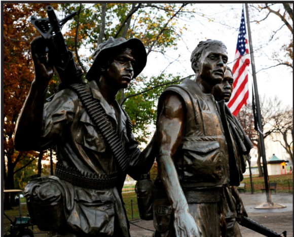
Three Servicemen Statue, Veterans Day 2008.