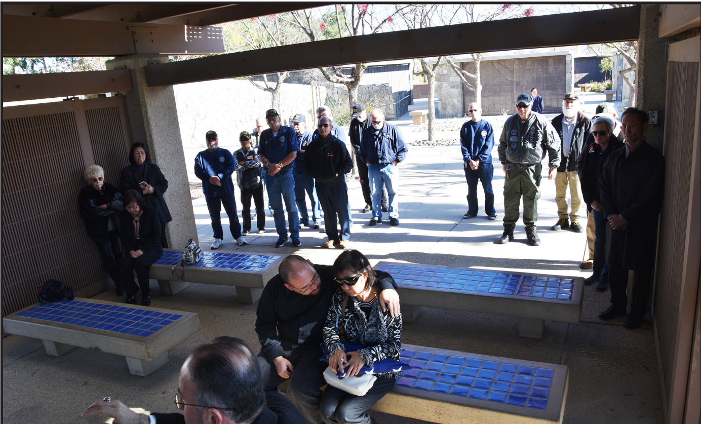
Chapter 47 members (back of shelter) attend a funeral service at Riveside National Cemetery.