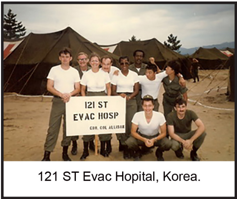
121 ST Evac Hospital, Korea.

Promoted to Brigadier General in 2005, she served as Chief, Professional Services, 3rd Medical Command at Fort Gillem, Georgia, which handled battlefield readiness for more than 27,000 Army medical personnel. She was inducted into the Order of Military Medical Merit in 2006.