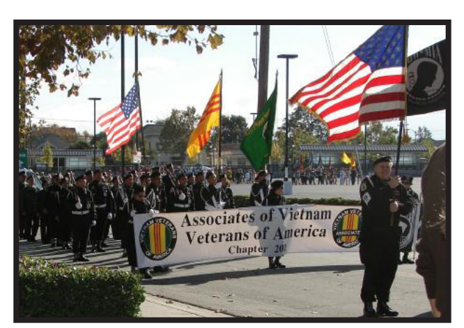
AVVA Chapter 201 at San Jose Veterans Day Parade 11-11-07.

* Mar 15, 2pm, VP-50 Memorial Service at Moffett, check at museum for info.