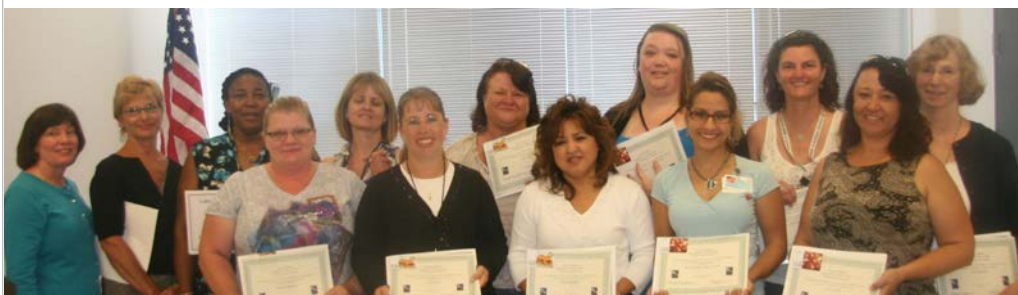
Employee Activities Committee